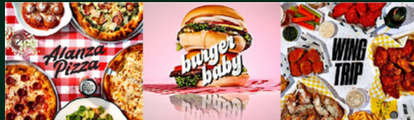
WONDER LICENSED PROGRAM